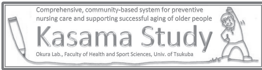
Fig. 1 Logo of Kasama Study